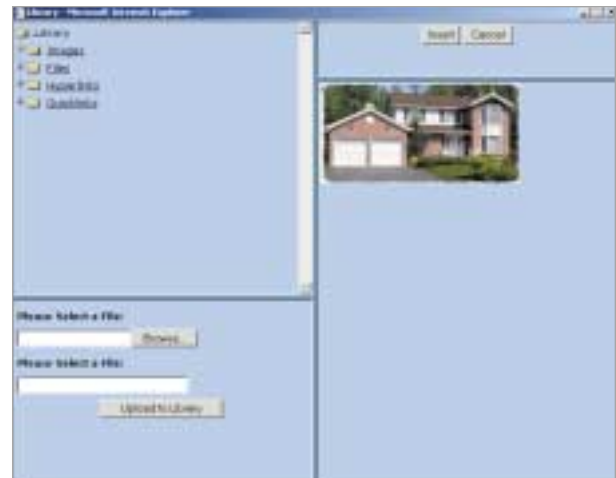
Users can see a preview of an image (shown here), file, or hyperlink in the library.